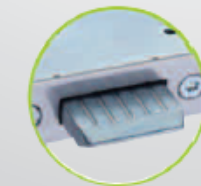
25mm horizontal centre dead bolt for enhanced security

All locks are supplied in a Silver Trivalent finish to comply to BS EN 1670 Grade 4 (240 hours).