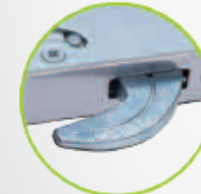
25mm deep throw bi-directional hooks for enhanced security