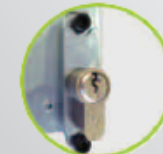
Available with first ever UK designed twin fix cylinder guard protection system, designed to eliminate cylinder snapping